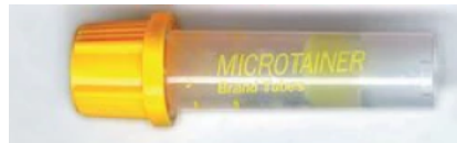
Paediatric Yellow top (SST) tube